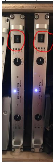
Amps in Cupboard: